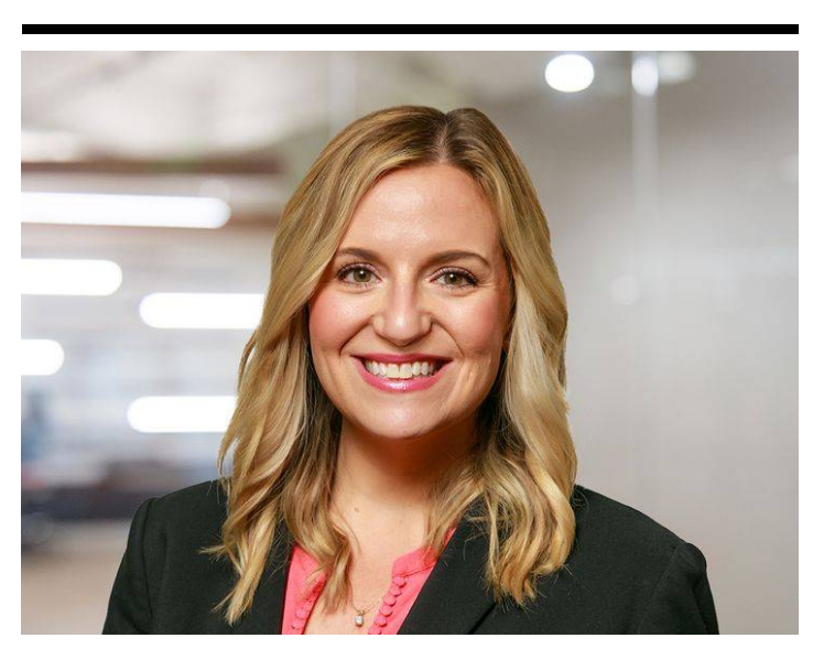
Copyright © 2024 Fisher Phillips LLP. All Rights Reserved.