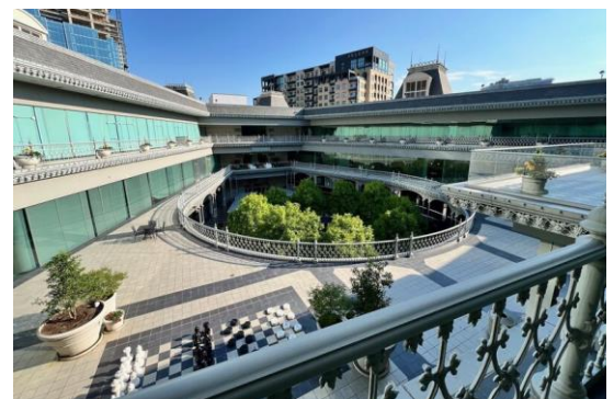
An outdoor patio with seating that is part of Fisher Phillips' recently relocated Dallas office looks out onto a unique tree-filled atrium and life-sized game board.

Sloustcher said the dining, shopping and lodging in the area means firm attorneys have lots of choices when it comes to meeting outside the office with colleagues or clients. The building's amenities include an outdoor patio, a fitness center and a spa.