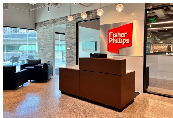
Fisher Phillips' new Dallas shop in the iconic Crescent Atrium is nestled in the triangular, low-rise portion of the mixed-use complex.